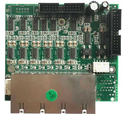
XR0126 Top View